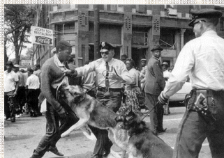
March on Birmingham, 1963